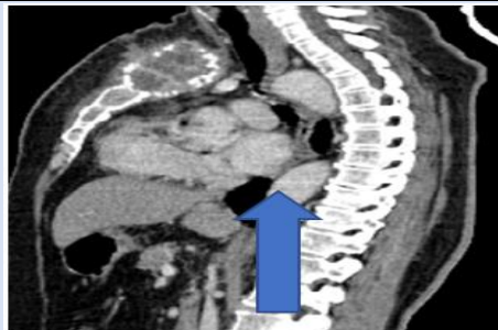
Figure 2: Sagittal cut of an injected CT-scan, focused on the sternal mass.