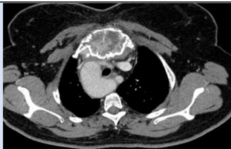
Figure 1: Axial section of an injected CT-scan, focused on the sternal mass

for a sternal swelling and a progressive chest pain. A thoracic injected CT-scan was performed (Figure 1 and 2).