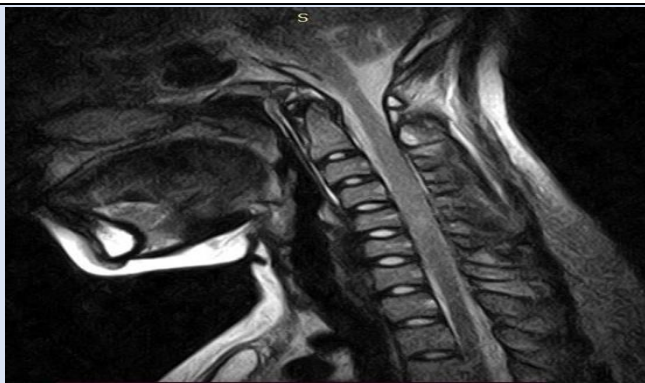
Figure 1: T2W images show segmental cervical cord thickening, a heterogeneous signal, with no focal mass formation within the spinal cord. There is mild, segmental thickening of the cervical cord over a length of three centimeters, from c3/4 to c4/5.

The patient was taken to a recovery room, and after two hours she was taken to the postnatal ward, high dependence unit for observation where ambulation and oral sips were then started. On the second day after the operation, an MRI of the spine was done (figure 1 and 2).