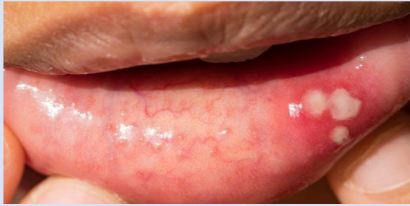
Figure 2: oral lip ulcer and white patches.