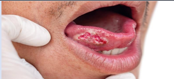
Figure 4: Tongue cancer.

Other potential symptoms of oral cancer include [2]: