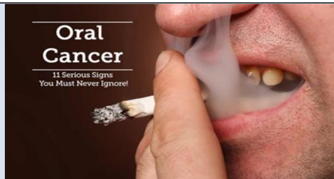
Figure 3: Smoking cigarettes

tongue) are linked to human papillomavirus (HPV), a common sexually transmitted virus. Overexposure to ultraviolet (UV) rays from the sun, tanning beds, or sunlamps is a cause of cancer on the lips. Occupational exposures, or being exposed to certain substances while on the job, can increase the risk of getting cancers in the nasopharynx. Working in the construction, textile, ceramic, logging, and food processing industries can cause people to be exposed to substances like wood dust, formaldehyde, asbestos, nickel, and other chemicals. An infection with the Epstein-Barr virus, a cause of infectious mononucleosis and other illnesses, can raise the risk of cancers in the nose, behind the nose, and cancers of the salivary glands.