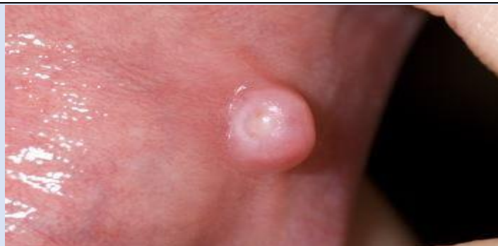
Figure 5: Oral Growth.